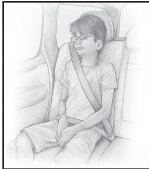
Figure 6. Lap and shoulder seat belt.