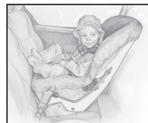
Figure 2. Convertible car safety seat used rear-facing.