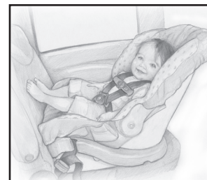
Figure 1. Rear-facing-only car safety seat.